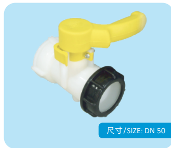
尺寸/SIZE: DN 50

HDPE extrusion blowing container suitable for many different liquids storage and transport. The surface of container make trough type for reinforcement it and durable.