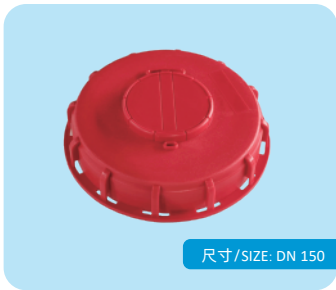
尺寸/SIZE: DN 150